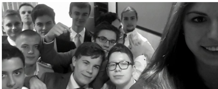
foto: Committee selfie