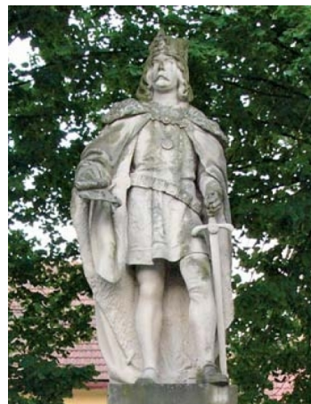
foto: statue of George from Poděbrady, Kunštát, Czech Republic