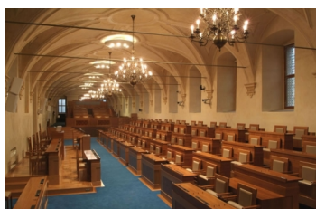
foto: Jednací sál, Czech Senate

Since the EEYP is gaining in popularity, we are going to be observed during the General Assembly by some intrigued students and teachers from gymnasium Na Zatlance in both venues, hotel Theatrino and the Czech Senate.