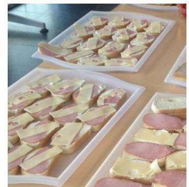
foto: More snacks for our hungry EEYPers