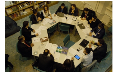
foto: Meet the Boss

never encountered the problem in real circumstances. It was similar to learning chemistry inside the lab and outside the lab."