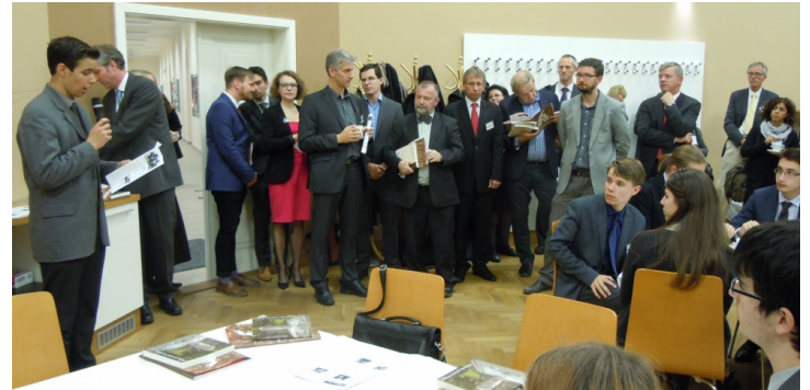
Meet the Boss