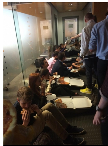
foto: Everyone enjoying pizza

Everybody's eyes lit up immediately as they ran for the boxes of pizza and then sat in front of the offices, enjoying pizza with whoever else was sitting there and they were very satisfied. The break for lunch came to an end and everyone had to go back to their committees but were now in a great mood!